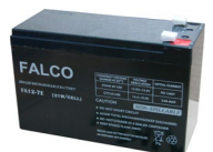
12V DC BATTERY